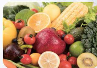
Fruit and vegetable storage